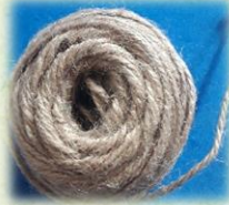
String or twine to hang your feeder.