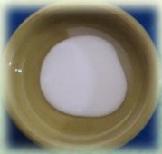
PVA glue with a dash of water added.

A pot/tub that you can cut. Milk or fruit juice cartons work well. Make sure you rinse it out first.