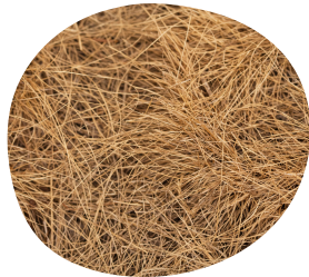
Straw, hay or dried grass