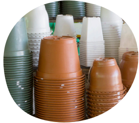
A small plant pot

Earwigs are mostly nocturnal, coming out to feed at nighttime. Their favourite food is soft plant matter, but they also eat smaller insects like aphids and fruit flies.