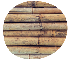
A bamboo cane or stick