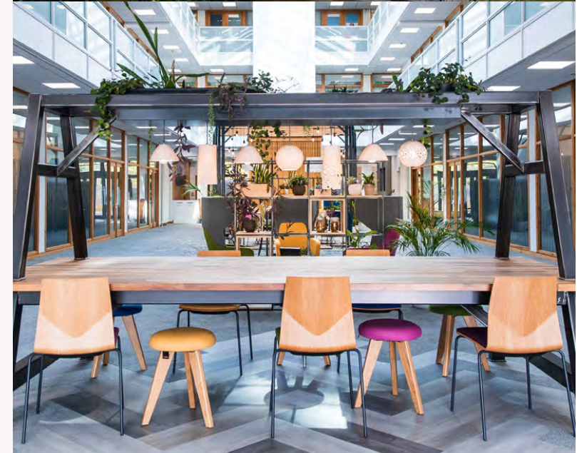
Top: overlooking the pond at Warren Park; bottom: café and communal meeting spaces at Shenley Pavilions.