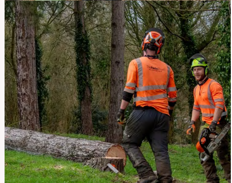
Top: thousands of trees are planted every year; Bottom: tree management ensures our green spaces thrive.