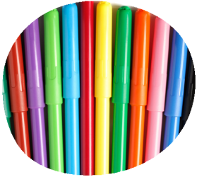
Colouring pens or pencils