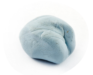
Sticky tac or similar