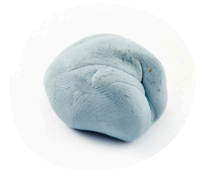
Sticky tac or similar