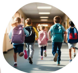
You and a friend!